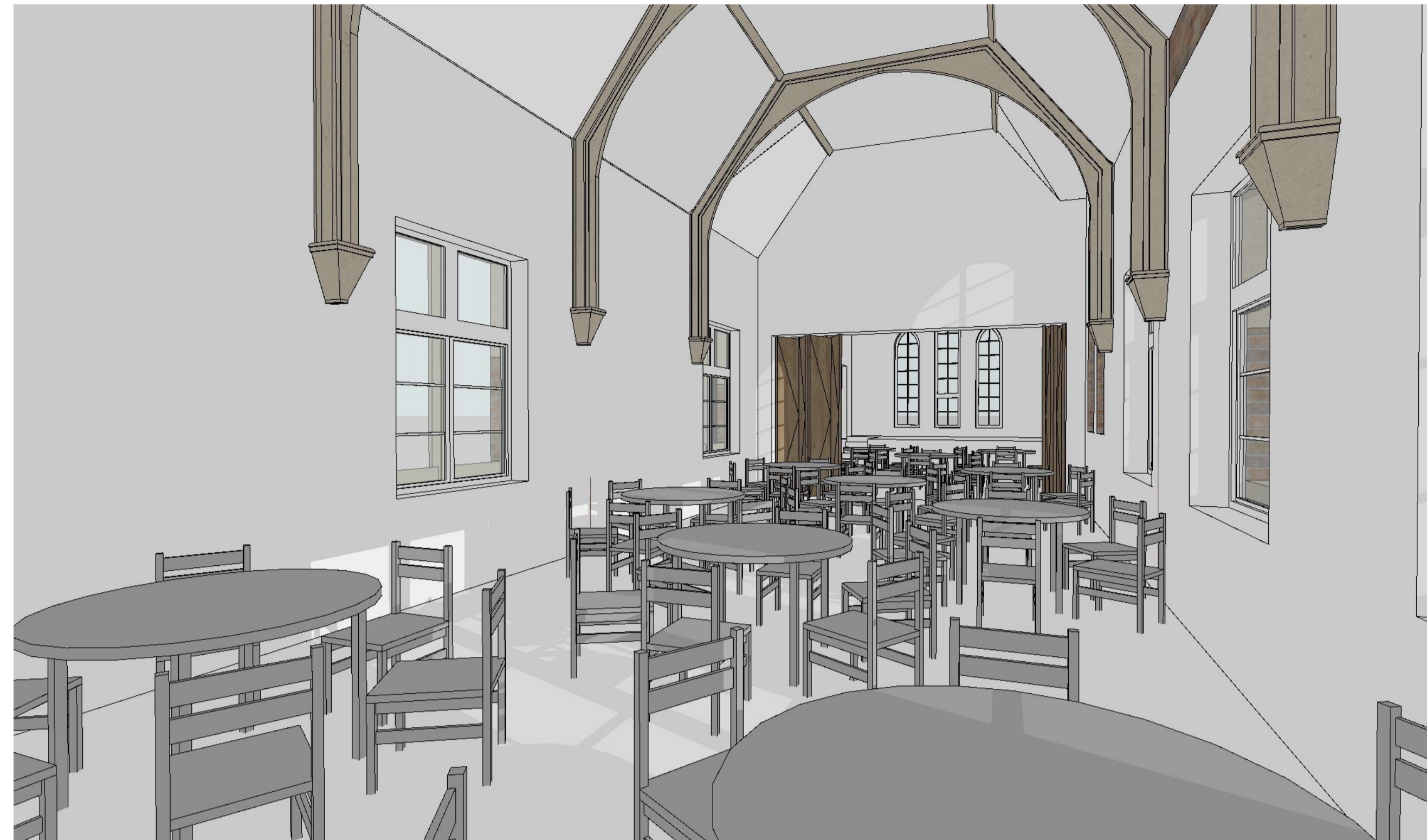
View within Community Room looking North (Toward Stage), Showing Proposed Opening